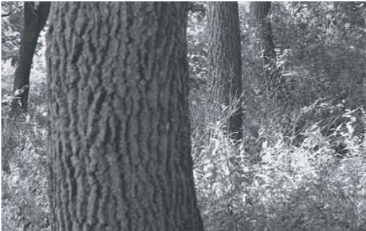
Lulu Lake Preserve hillside in 1991.