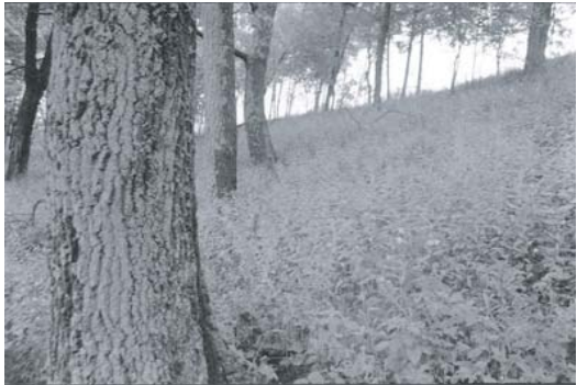
The same photopoint in 2000, after three biennial prescribed burns.